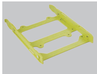
Tool-free 2.5"/3.5" HDD bracket