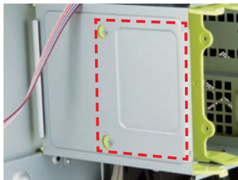
2.5" drive bay